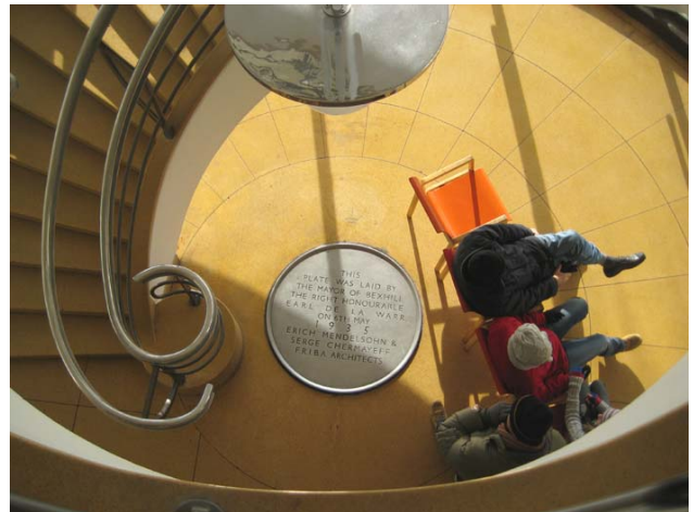
Carol Allen's "The Point"

The following prizes were awarded at the preview event on 1 st December 2009: